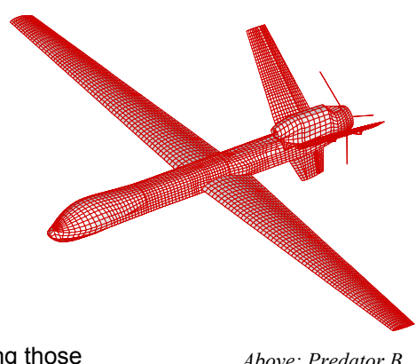
Above: Predator B structural model provided courtesy of General Atomics Aeronautical Systems